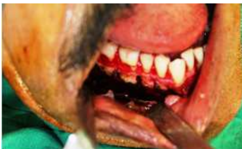
Fig 3: Application of Carnoys solution

Soft tissues adhering to the capsule of the lesion in the lingual fenestration were also removed. In the proximity of the mandibular canal, the capsule of the lesion was dissected from the inferior alveolar plexus. This was followed by single application of Carnoys solution imbibed gauze pellets for 5 min. Before the application of Carnoys solution care was taken to isolate the surrounding soft tissues and liquid paraffin soaked gauze was placed over the inferior alveolar nerve to prevent its damage. It is important to count the gauze pellets while placing and removing from the cavity to prevent and left overs inside the defect. Then, the lumen of the defect was re-rinsed with copious saline to flush off the solution from the bony cavity which sighted dark brown colored and fixated (Fig 3). Closure of flap was done by horizontal