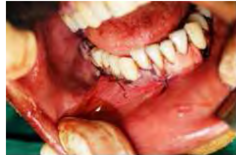
Fig 4: Postoperative: Closure done

mattress sutures using 3-0 vicryl (Fig 4). In the immediate postoperative period, the patient presented with paresis of the lower lip, which had a total regression after 7 months. After a period of 1 year, no sign of recurrence was observed.