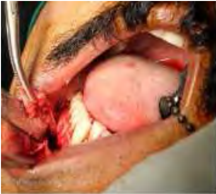
Fig 2: Intraoperative-Enucleation of pathological lining following peripheral osteotomy

KCOT was histologically confirmed after incisional biopsy. Informed written consent was taken from the patient and ethical committee approval was taken from Institutional ethical committee board. Mucoperiosteal flap was raised and buccal cortical osteotomy was performed to reach the bed of lesion. Enucleation of the lesion by intra approach was accomplished under general anesthesia (Fig 2).